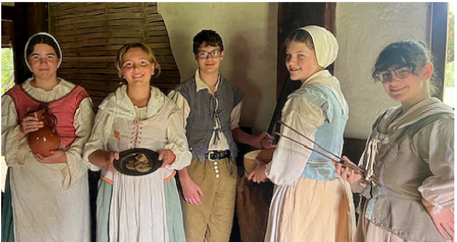
Historic St. Mary's City