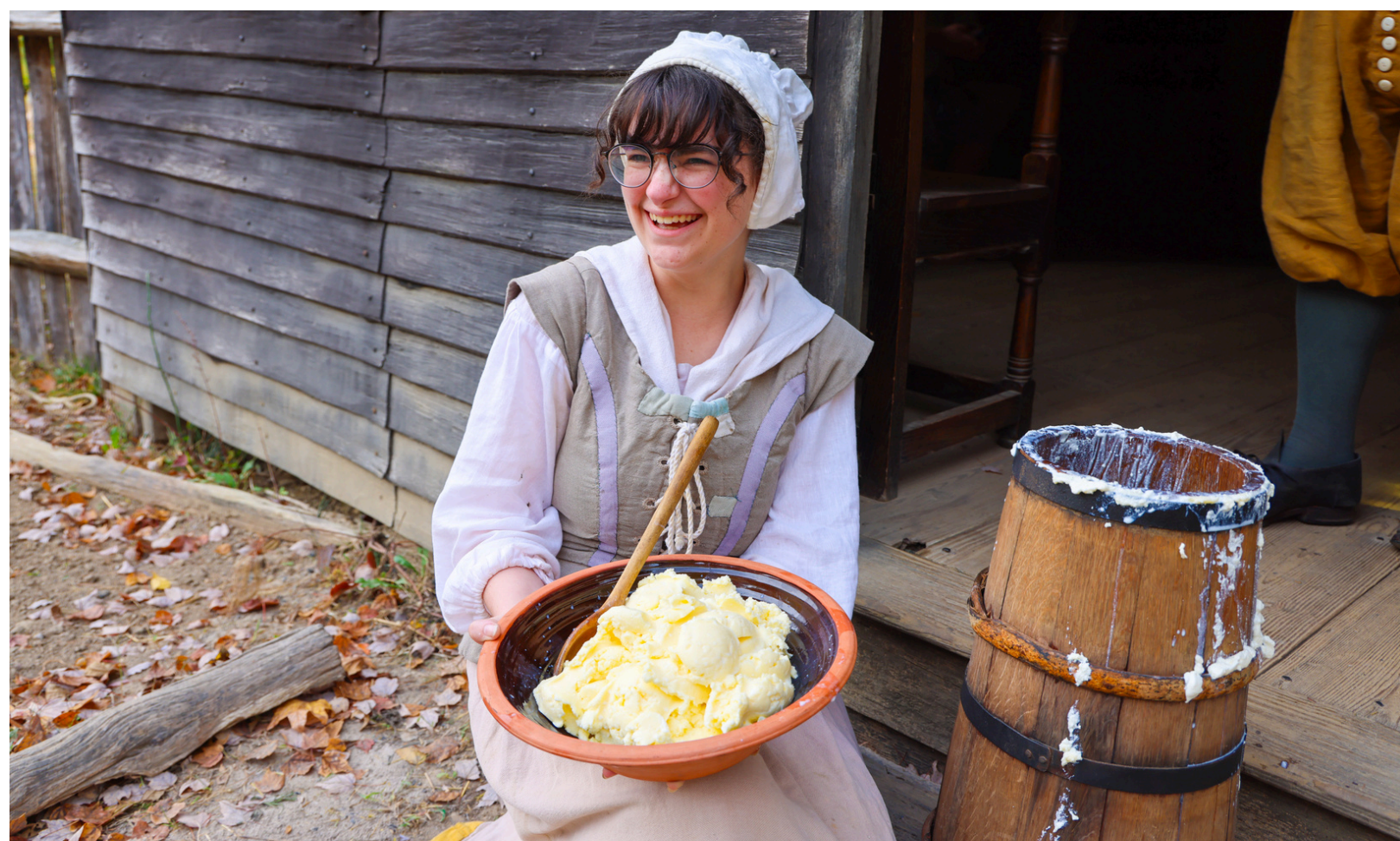
Historic St. Mary's City